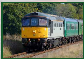
Class 31 31289 'Phoenix'

The mighty 1550hp locomotive, built in 1962 and spent its life operating around southern England.