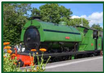
RSH No.62 'UGLY'

A powerful saddle tank locomotive, 'UGLY', built in 1960 and spent its life hauling steel trains at Corby Steel Works.