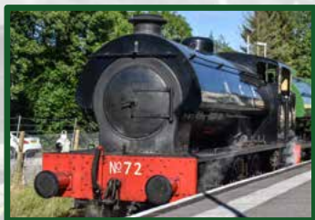
Class 10 D3489 'Colonel Tomline'

Another strong saddle tank locomotive, constructed in 1945 and spent its life hauling heavy coal trains at South Hetton Colliery.