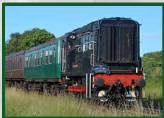
Class 33 33063 'R.J.Mitchell'

A powerful shunting engine, built in 1958 and spent its life hauling freight trains at Felixstowe Docks.