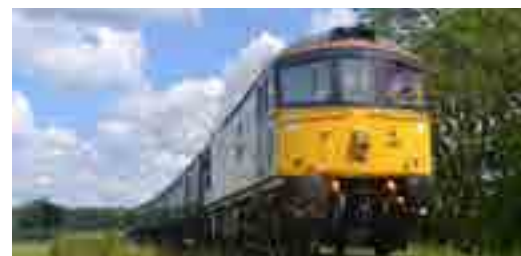
Class 33 33063 'R. J. Mitchell'