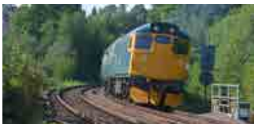
Class 27 27001