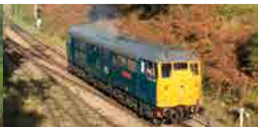
Class 31 31430 'Sister Dora'