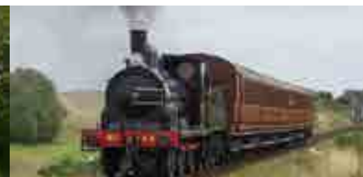
GER Y14 No. 564